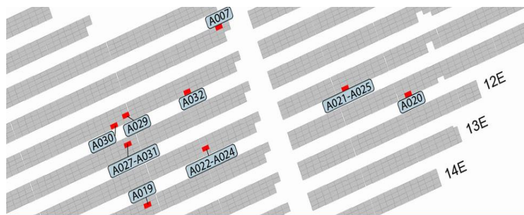
Figure 7. Hotspots map obtained with the software SOLAR INSPECTOR from PANOPTES

The software SOLAR INSPECTOR is based on a GIS engine that enables a full spatial management of the surveys. It is a complete solution that is used during the acquisition and in the post-processing. It displays the flight information from the UAV gathered by the telemetry directly in the base station as well as the map of the capture, the video, the timeline and an area to take notes.