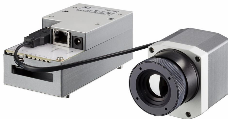
Figure 3: The radiometric camera OPTRIS PI450

AIR MARINE is using the light-weighted OPTRIS PI 450 which benefits from a radiometric flow. It has a strong thermal sensitivity that allows for the detection of small temperature differences. It acquires thermal images displaying temperature measurement on each single pixel. The camera also has a high sample frequency as well as a good resolution. It helps maintaining good operation performance without being too heavy. The temperature range that can be measured lies between -20°C and 900°C.