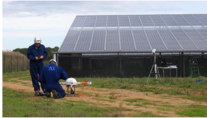
Figure 4: Telepilots deploying their material MICRODRONES md4-1000

Usually, solar farms are located in non-populated areas which correspond to scenarii in the UAV French regulation. It is then permitted to use the md4-1000 from the German brand MICRODRONES, which is a reliable and stable quadricopters. This drone is well known for its unique payload/endurance ratio. It carries 1,2 kg for an operating time of 35 to 40 minutes.