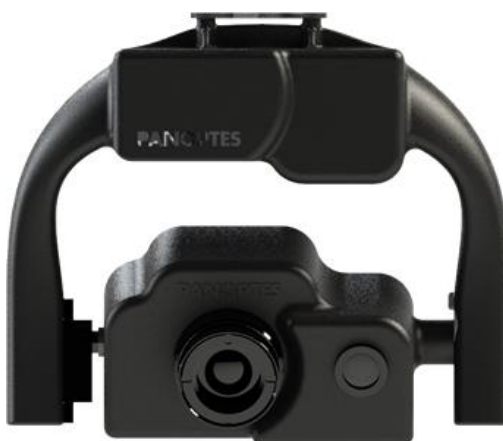
Figure 1: The bi-sensor TIR and VIS mT-Panoptes, part a dedicated solar panel inspection solution

AIR MARINE uses either a thermal imager or a radiometric camera depending on the customers' needs. It owns a dedicated solution combining a sensor and a software designed by the Italian company PANOPTES especially for solar panel inspection. The solution is named mT-Panoptes. The sensor has two channels: one in infrared from a FLIR TAU 640 and one in the visible spectrum thanks to a photo camera. The infrared camera has the advantage of implementing its data into a so-called SOLAR INSPECTOR software. This software automatically georeferences the hot spots discovered in the workflow in real time. In order to do so, the user has to implement a georeferenced map of the solar farm. Existing maps can be used or a new one can be built thanks to a previous aerial RGB pictures acquisition and a photogrammetric post-processing.