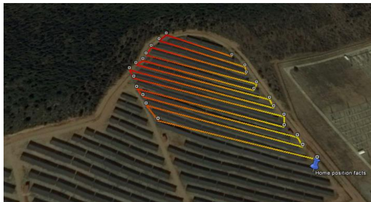
Figure 5: Flight plan example

It is crucial to listen and understand the needs of solar plant manager to build up on his competencies. First, AIR MARINE discusses back and forth with the client and translates what needs to be done to the operational team. Internally, telepilots in charge of the acquisition work together with the post-processing team to ensure that the capture will achieve an optimal deliverable. Those interactions allow for a final report that responds to high quality standards fulfilled by AIR MARINE.